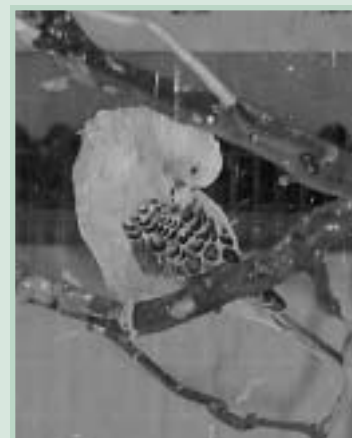
Bird – Just like home, The Floridean has pets too. For nearly six years Floridean's resident parakeets have delighted residents and visitors alike.