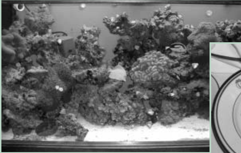
Floridean's fish tank in a bright sitting area, is a popular attraction. There is a "Nemo", hermit crabs, exotic living corals and even shrimp!