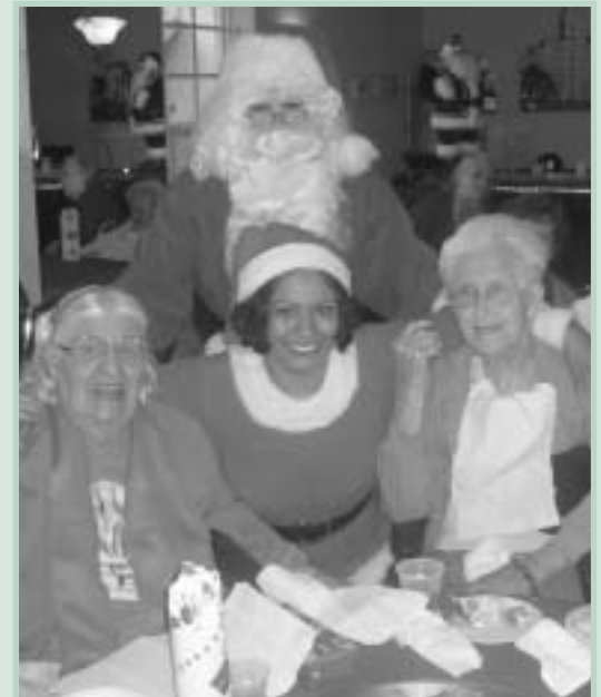
Mr. and Mrs. Santa – "The best Christmas Party ever!" was the overall sentiments from all those that attended. And this year, Mrs. Claus joined her husband in the celebration.